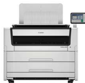
PlotWave 5000 series